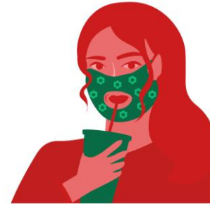
“The Escape Hatch”