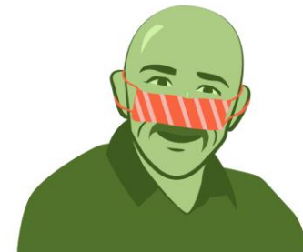
“The Nose Plug”